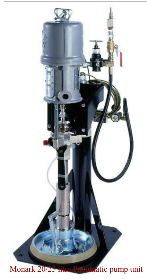
Monark 20/25 litre Pneumatic pump unit